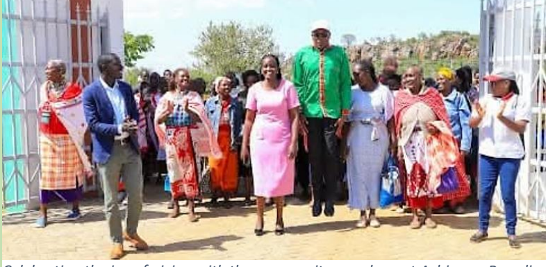
Celebrating the joy of giving with the community members at Achievers Paradise Phase 1 in Kimuka with the Optiven Foundation on 18<sup>th</sup> December 2024.

We also had an exciting Christmas campaign aimed at rewarding our investors during the festive season. As we gave back to our investors we also reached those living with challenges by donating food and gifts to different children homes under the Optiven Foundation with the Christmas Caravan on 20<sup>th</sup> December 2024. Together with our staff from the Absa and Karen offices, it was heartwarming to put smiles and laughter in the hearts and faces of our sisters and brothers.